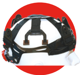
PRAIA 8215 Art. no. 6.78.215.00