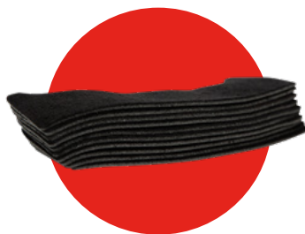
KIGALI 8205 Art. no. 6.78.205.00